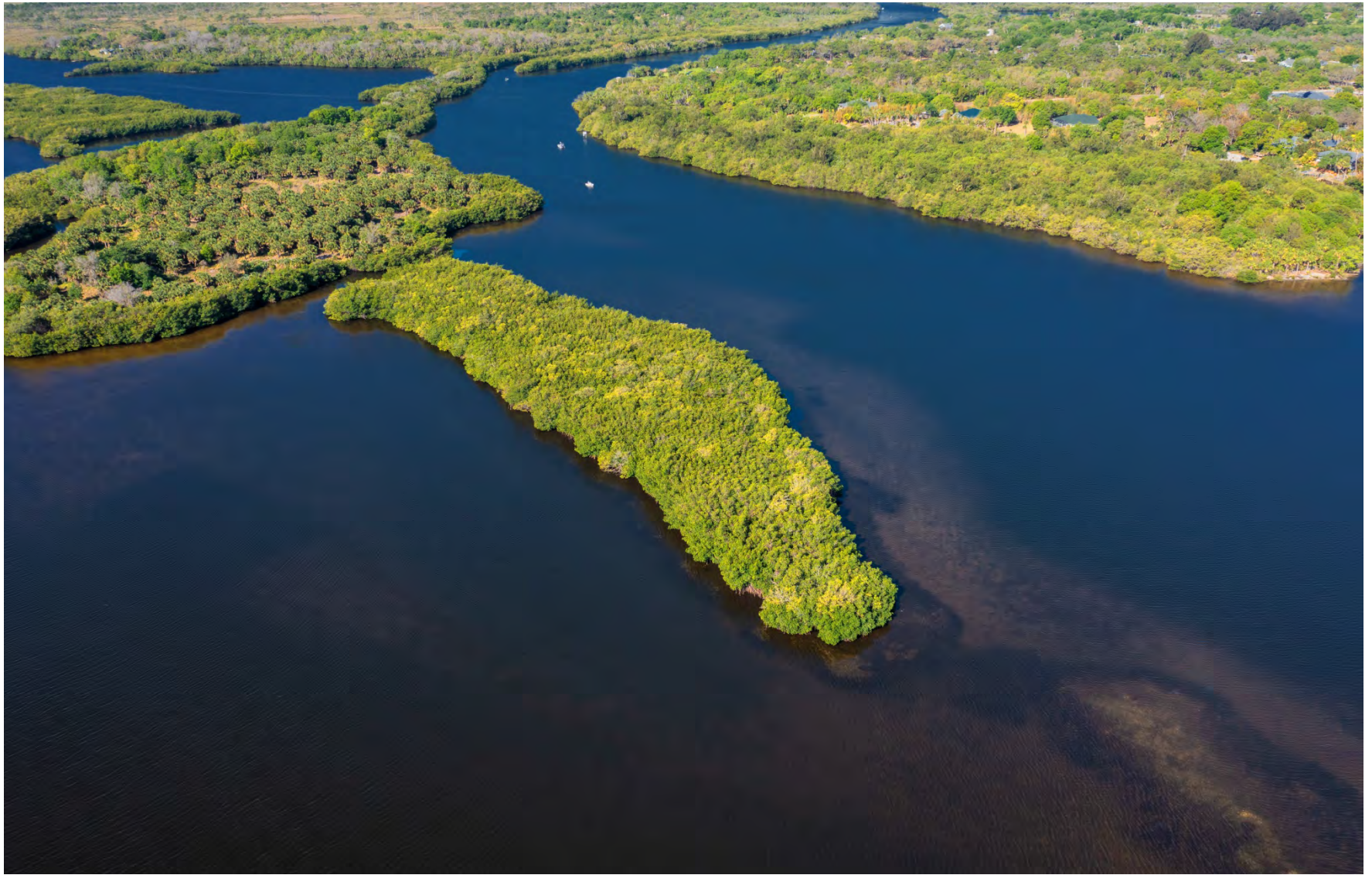
Goodrich Island looking west towards St. Sebastian River Preserve State Park