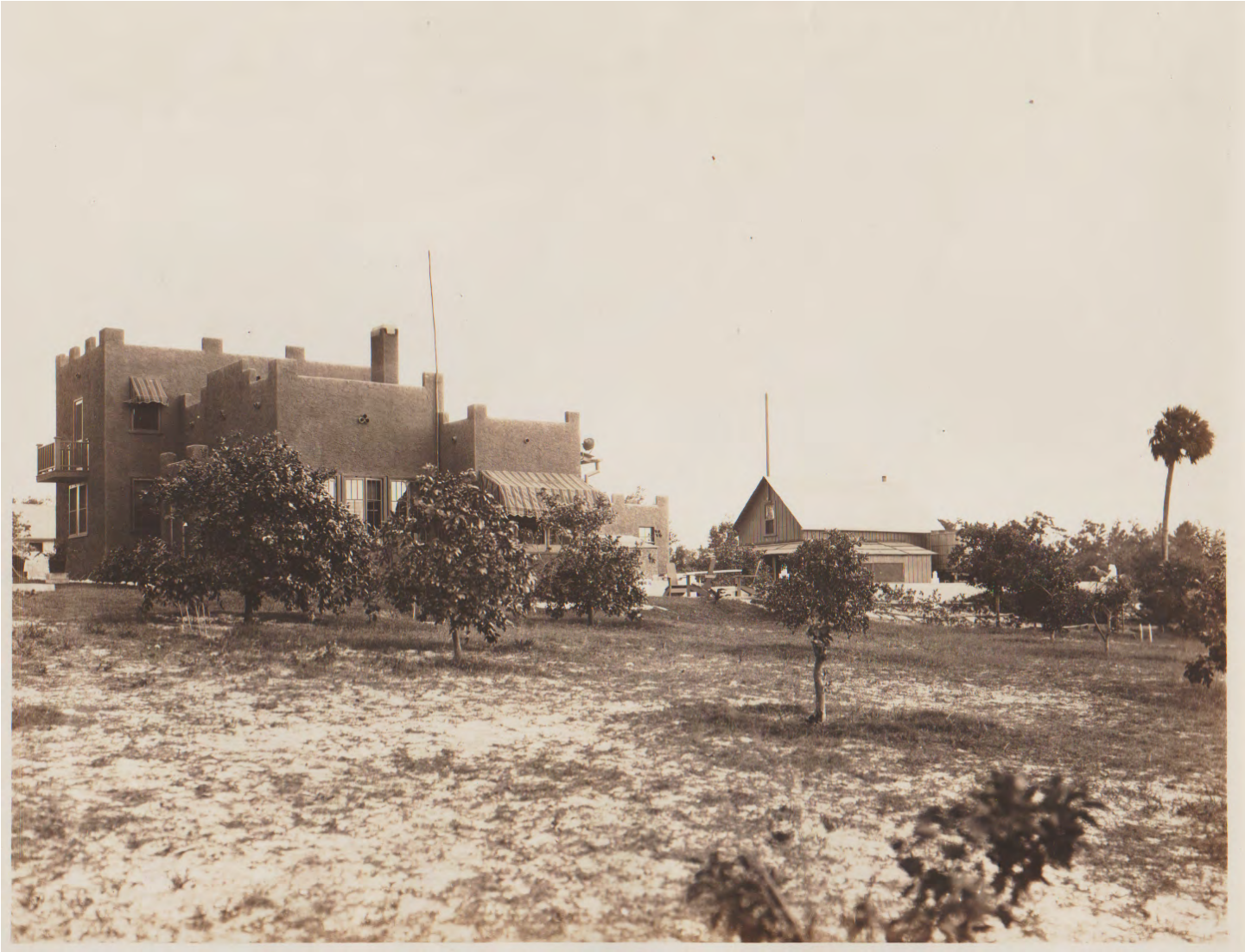
Original Goodrich home, built c. 1927 and burned in the 1930s