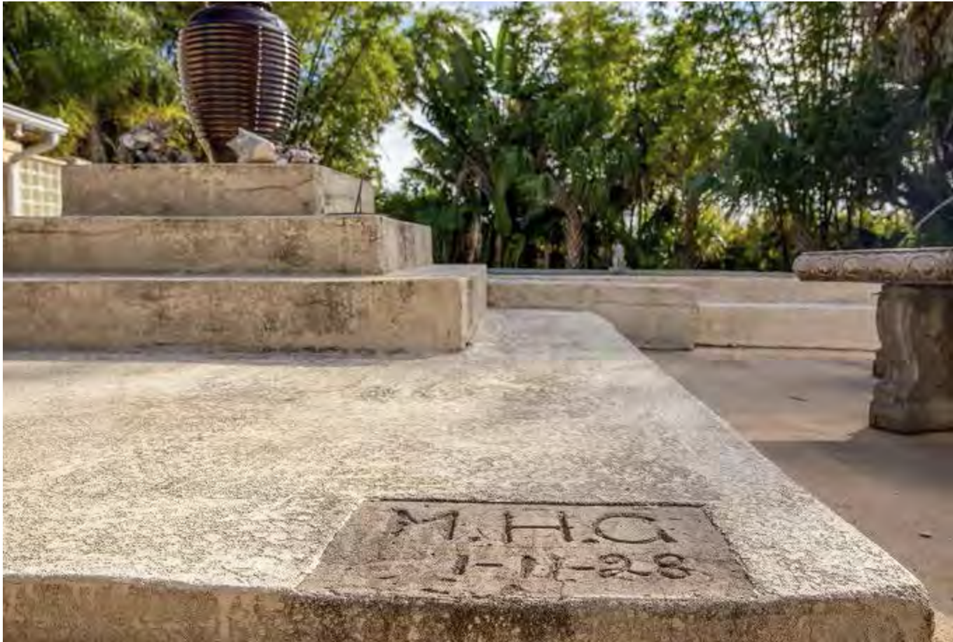
Goodrich pool deck with Mary's initials