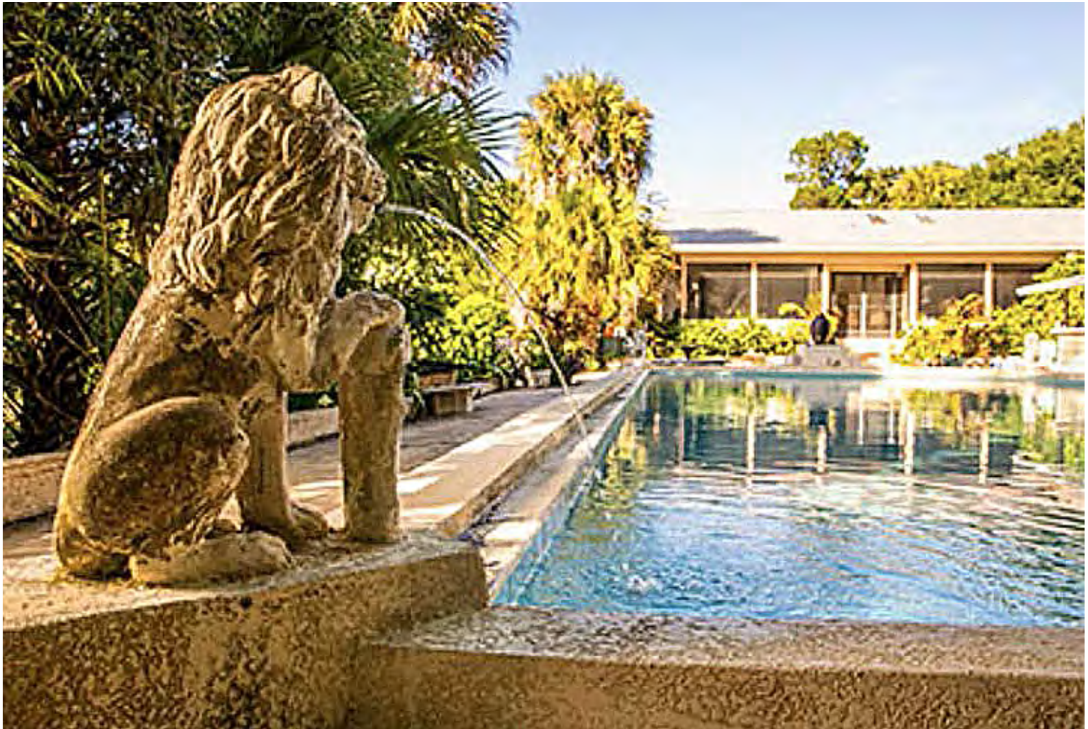
Goodrich pool today with original lion fountain.