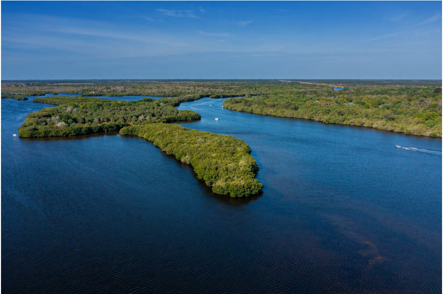
Goodrich Island looking west towards C-54 Canal