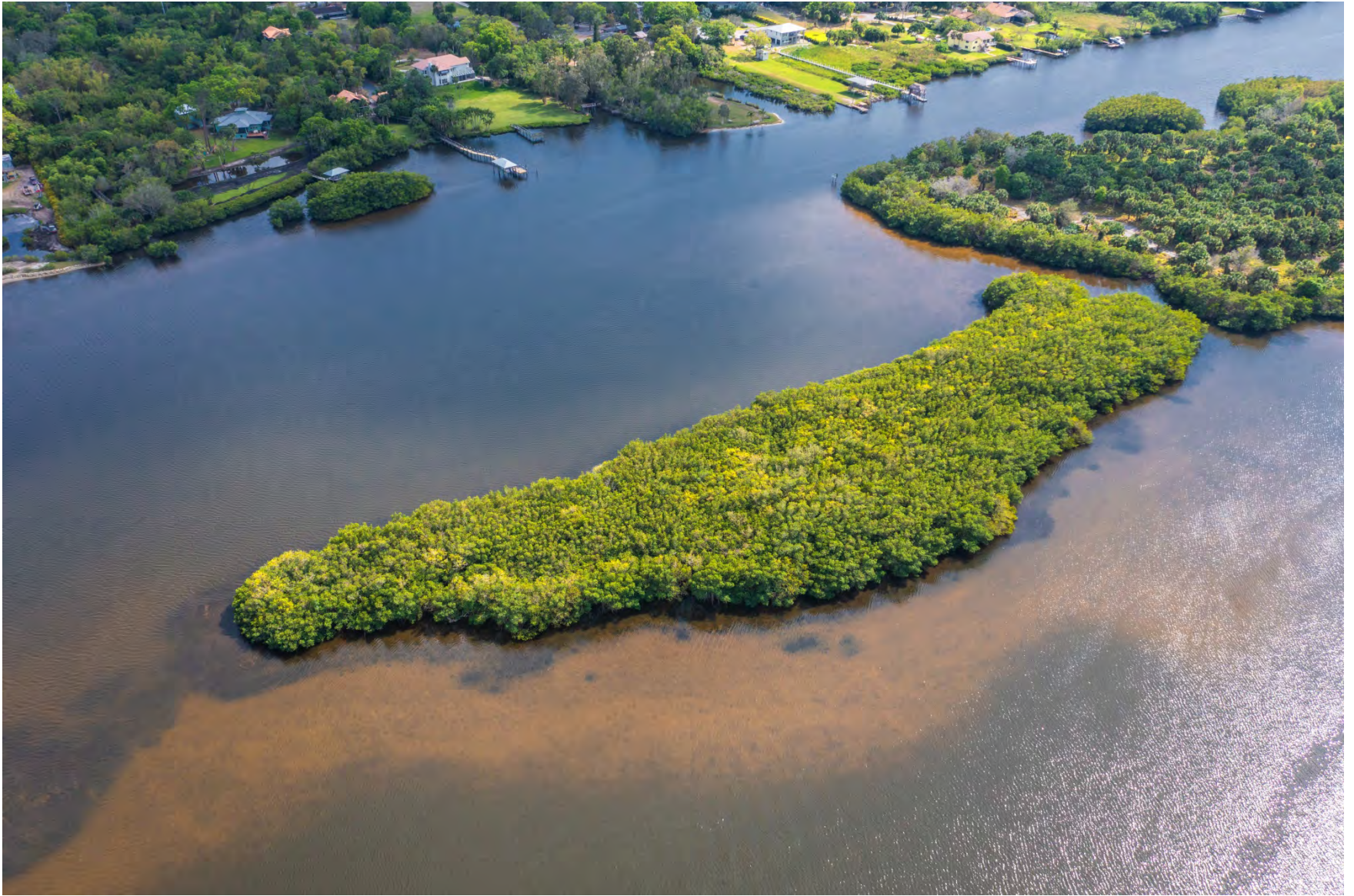
Goodrich Island looking south towards Roseland