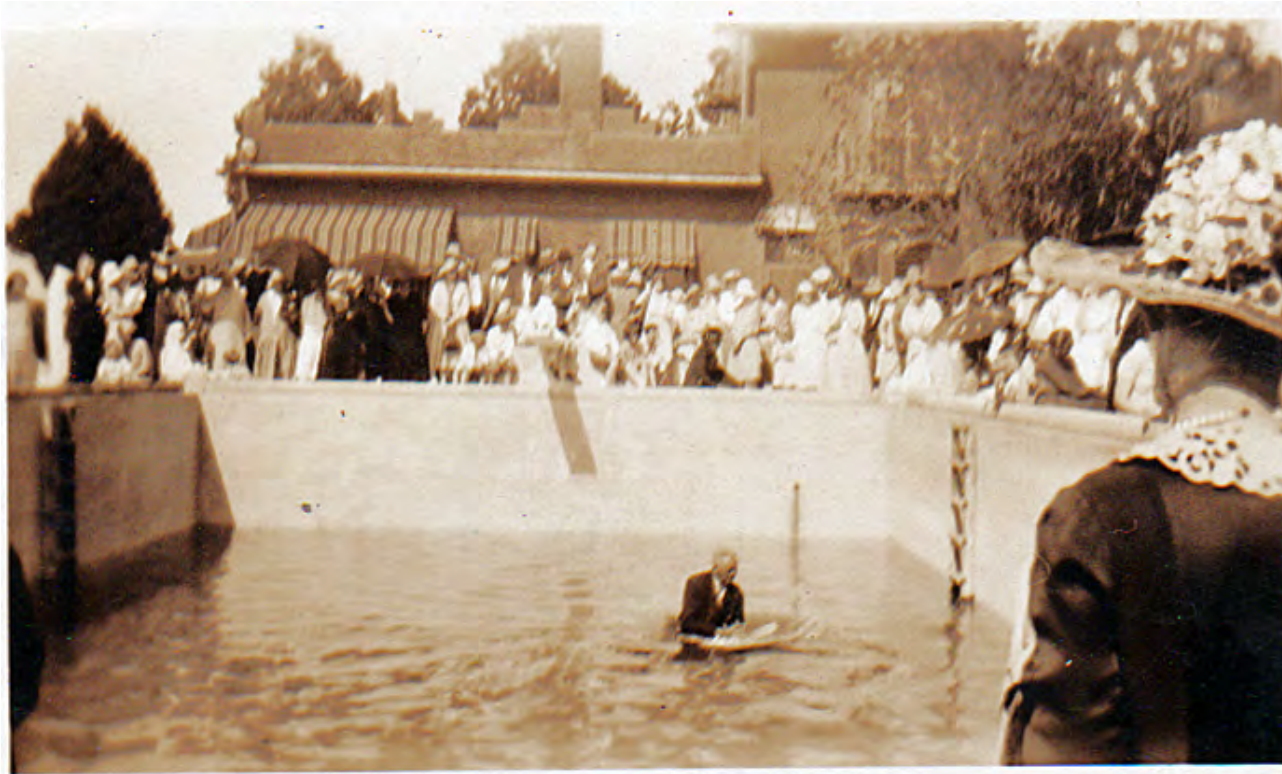
Being one of the only pools in the area at the time, baptisms were often held at the Goodrich's home. It was a deep pool and therefore had to be partially drained to accommodate. C.1929