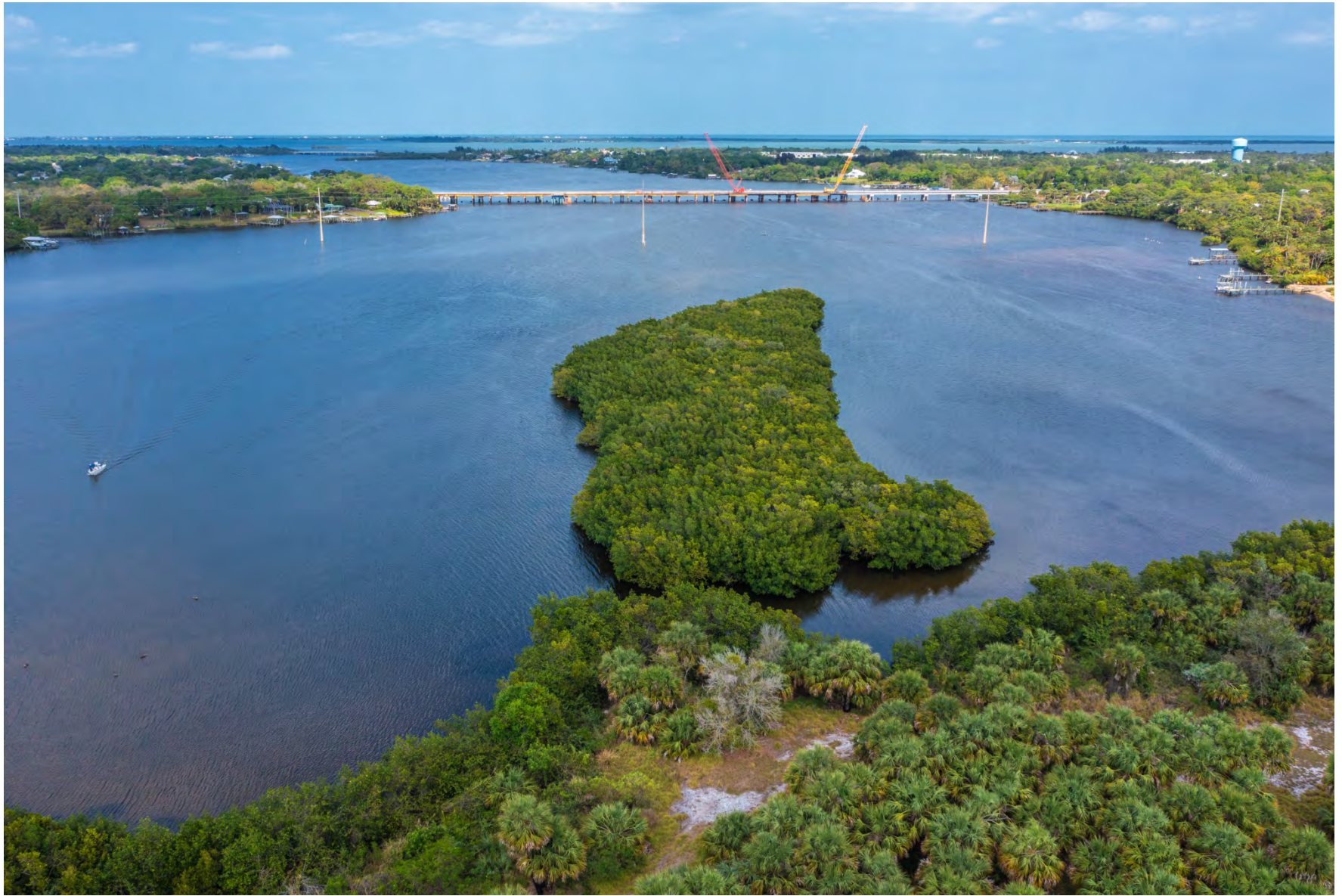
Goodrich Island looking northeast