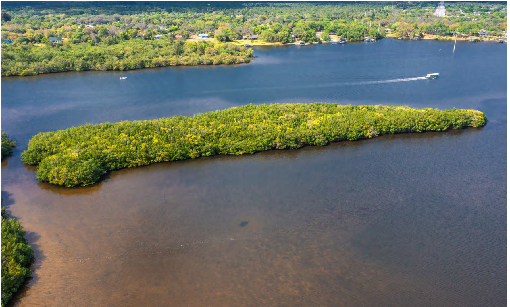
Goodrich Island looking north towards Micco