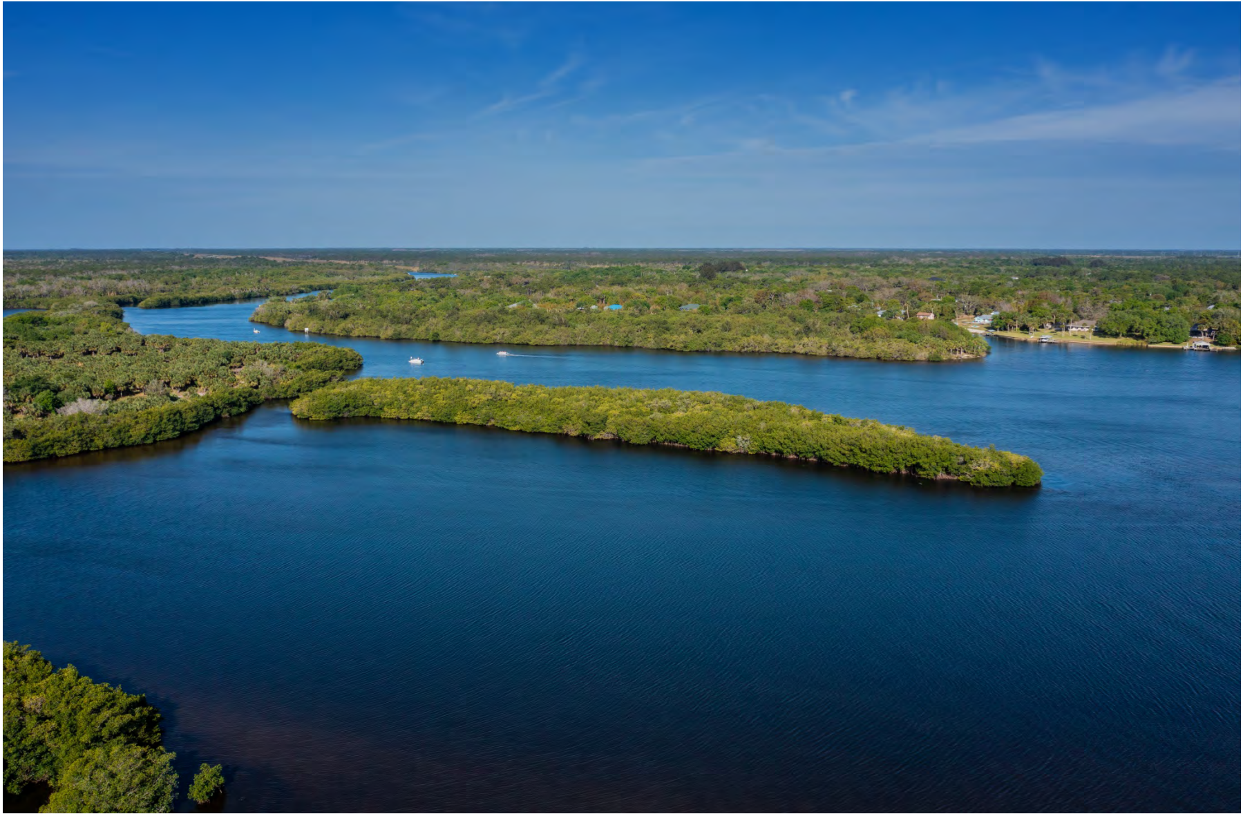
Goodrich Island looking northwest towards Micco